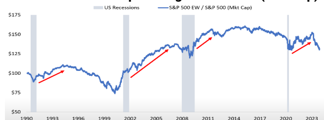
Exhibit 5: S&P 500 Equal Weight / S&P 500 (Mkt Cap)

Data from January 31, 1990, through November 30, 2023. Calculations use monthly price returns. January 31, 1990 = $100. Past performance is not indicative of future results. Indices are typically not available for direct investment, are unmanaged, and do not incur fees or expenses.