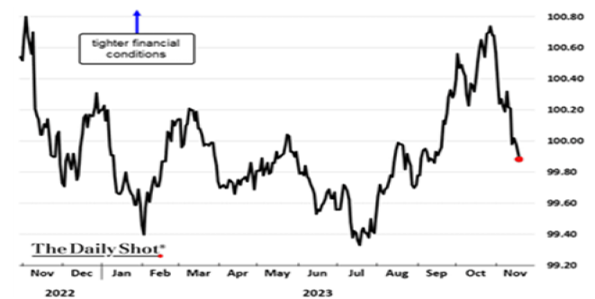
Exhibit 2: Goldman Sachs US Financial Conditions Index

Data as of November 20, 2023.