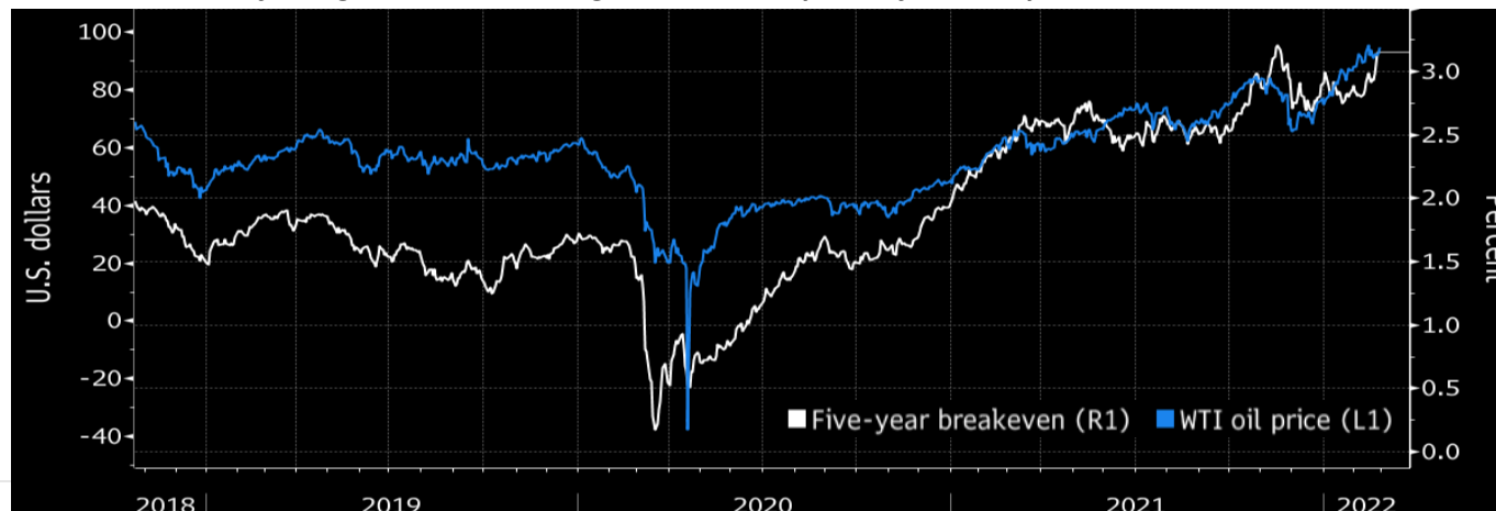
Crude Boost: Oil is fueling a near-record surge in market-implied inflation expectations